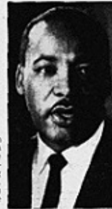
DR. MARTIN LUTHER KING