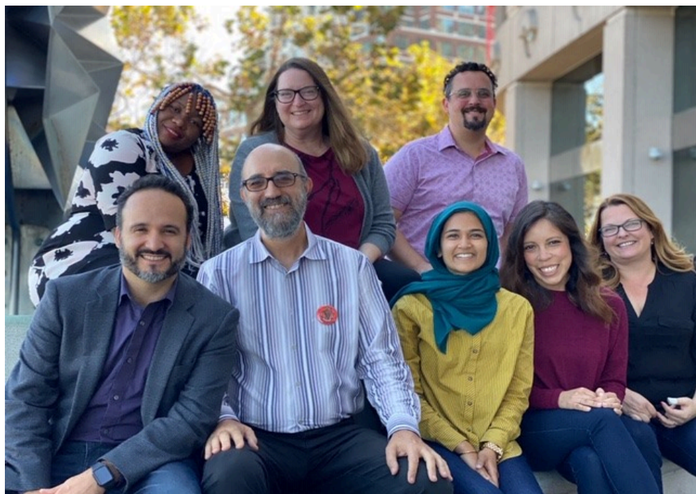
Our housing justice team

A nonprofit law firm and advocacy organization founded in 1971 that challenges the systemic causes of poverty and racial discrimination by strengthening community voices in public policy and winning tangible legal victories advancing education, housing, transportation, & climate justice.