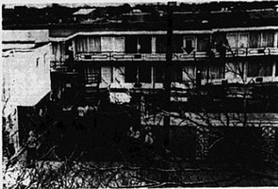
Arrow Indicates Where Dr. King Was Standing When Assassinated